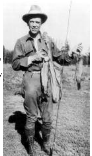
~ Aldo Leopold: The Good Oak

To avoid the first danger... plant a garden, preferably where there is no grocer to confuse the issue. To avoid the second, he should lay a split of good oak on the andirons, preferably where there is no furnace, and let it warm his shins while a February blizzard tosses the trees outside..."